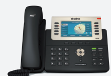
T28P → T29G