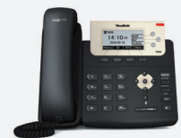
T22 → T23G

Yealink T2 Series IP phones True IP Solutions UCC Service