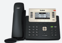
T26P → T27G